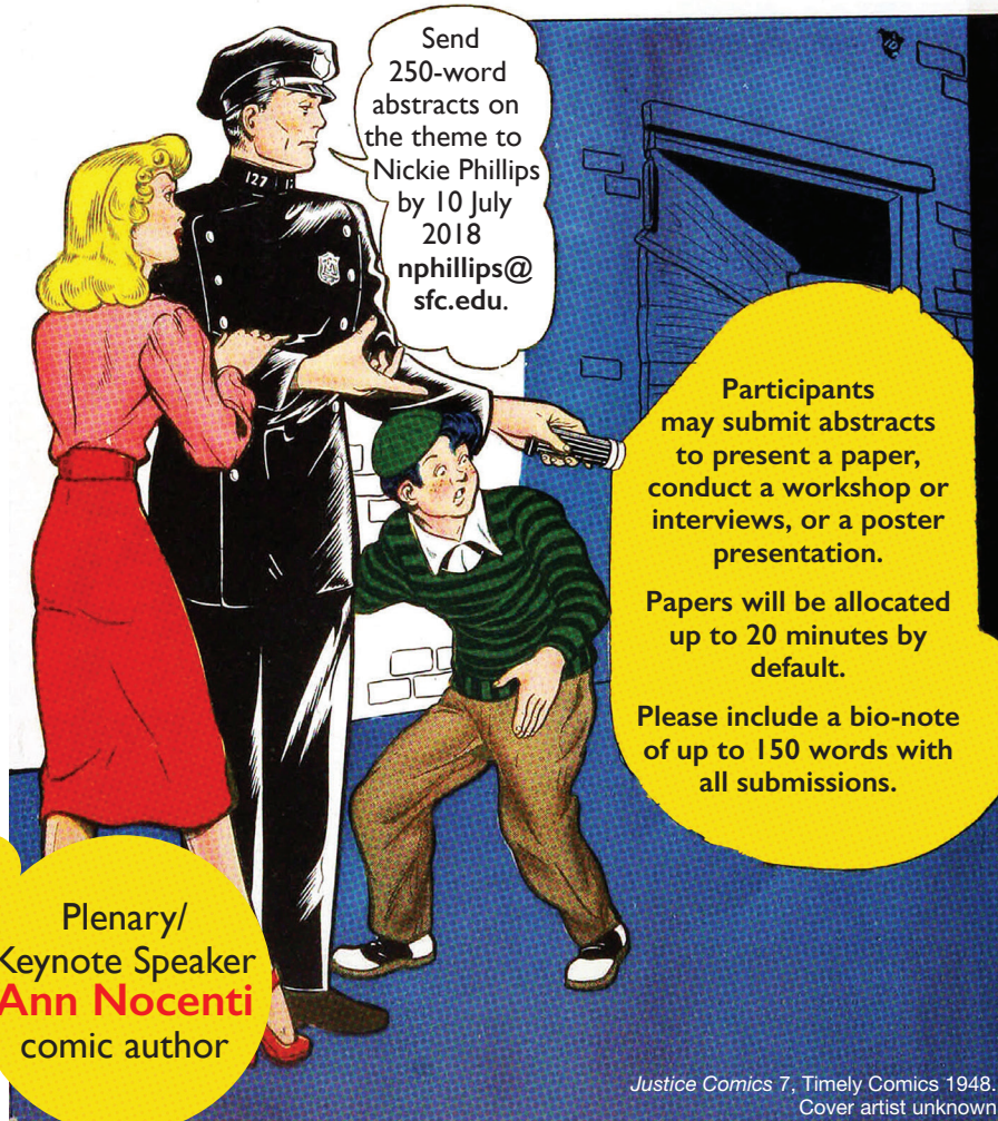
Justice Comics 7, Timely Comics 1948. Cover artist unknown